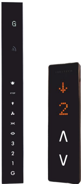
Aero Color Options: • Black • White