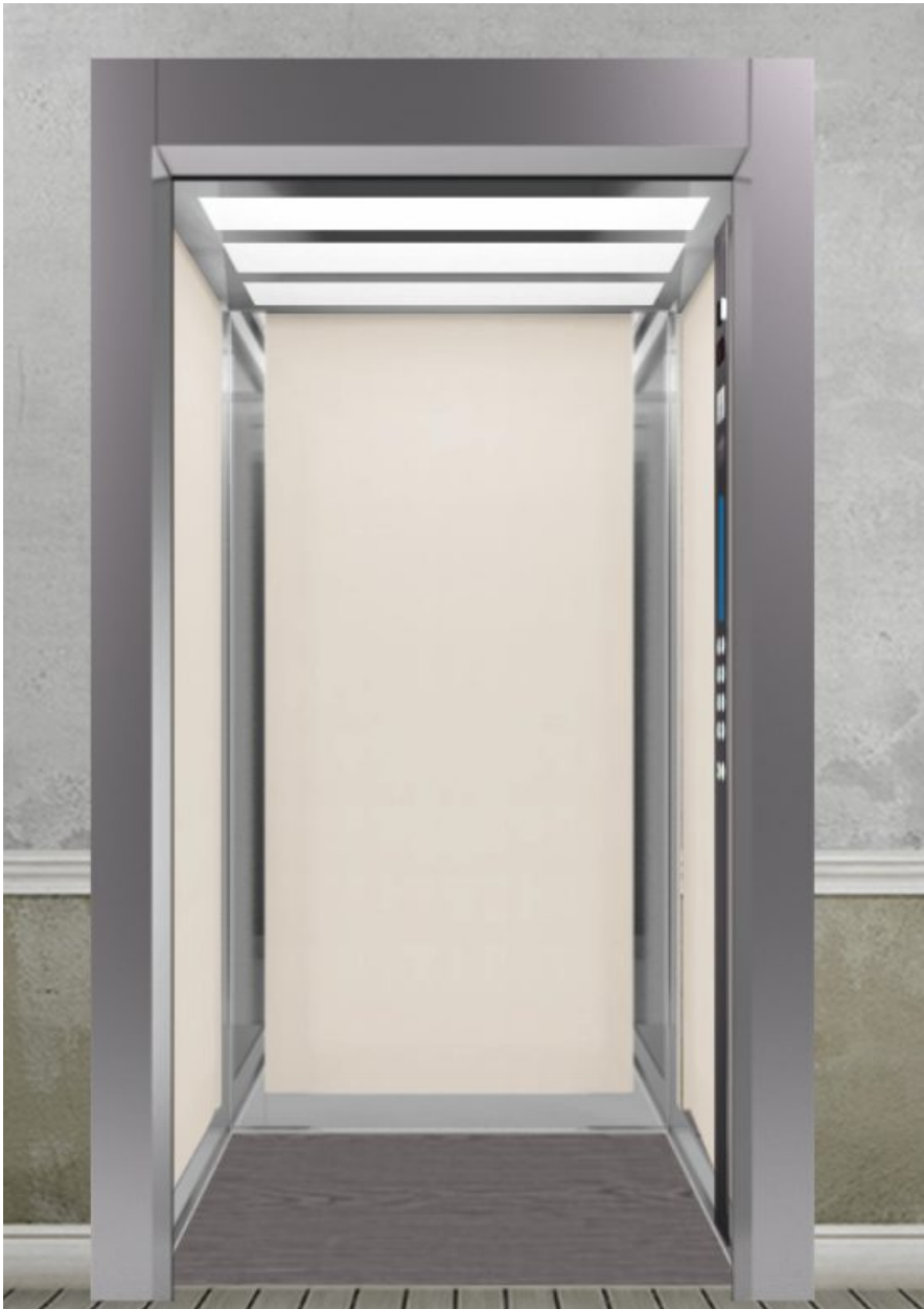
Cabin Panels – Powder Coated MS Flooring – Plain Vinyl Sheet False Ceiling – Model 101