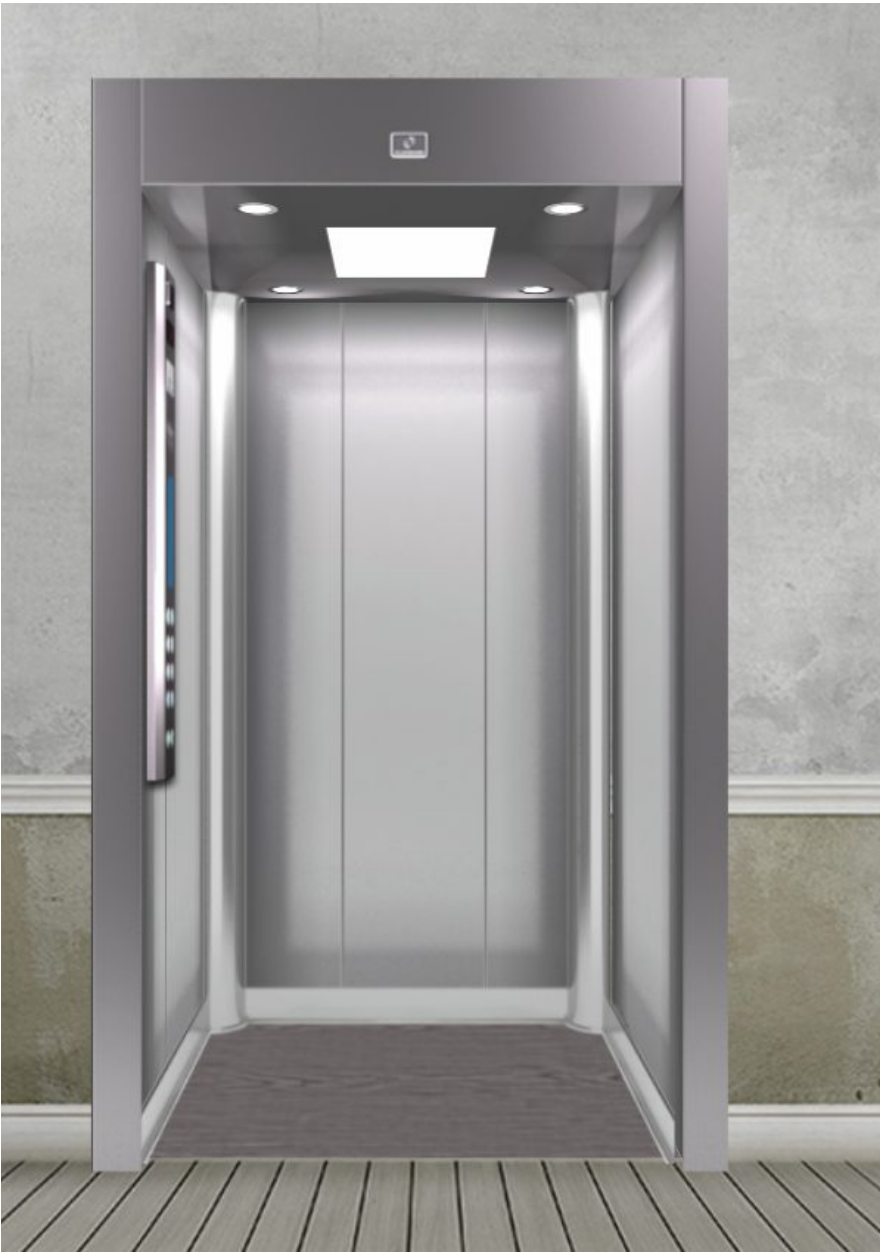
Cabin Panels – SS 304 Flooring – Wooden Vinyl Tiles False Ceiling – Model 102