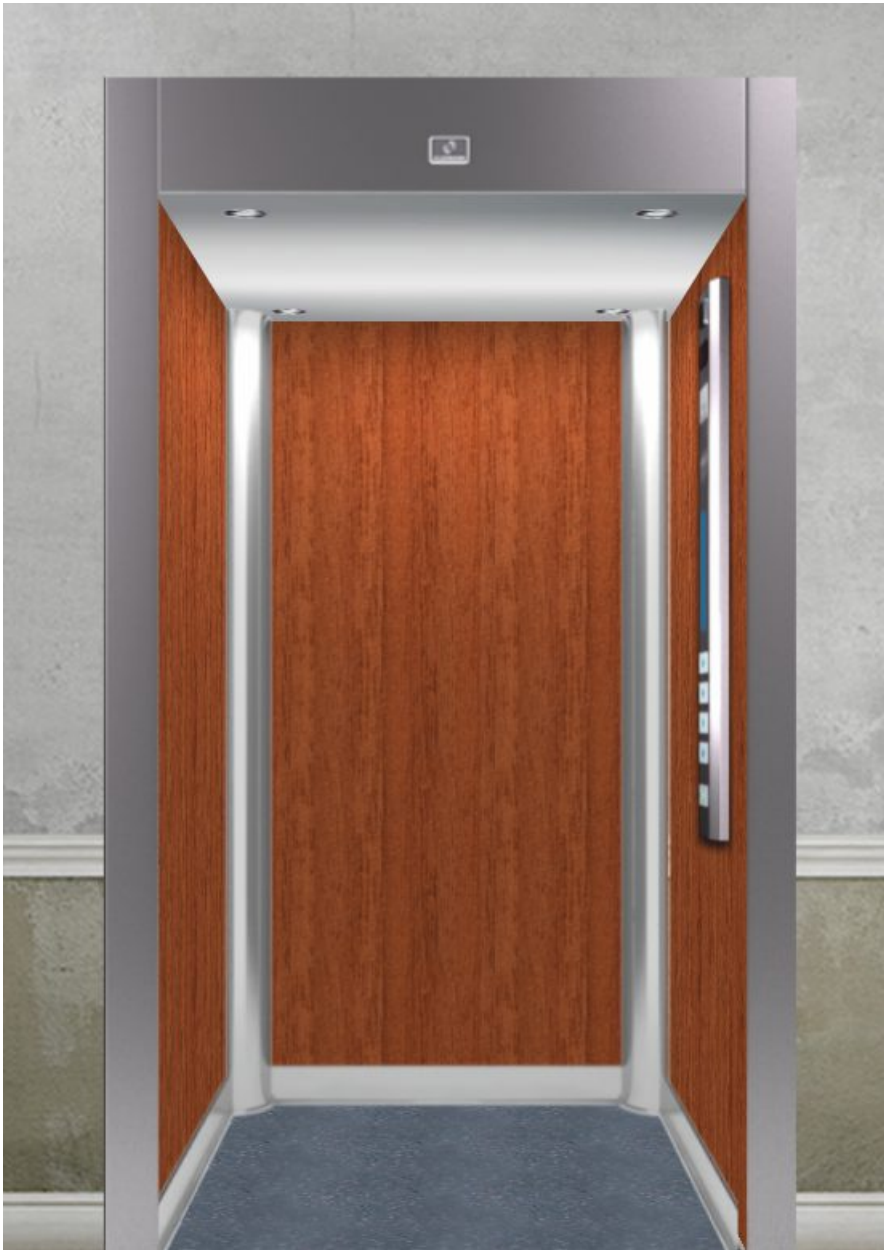
Cabin Panels – Wood Panels Flooring – Granite Stone False Ceiling – Model 104