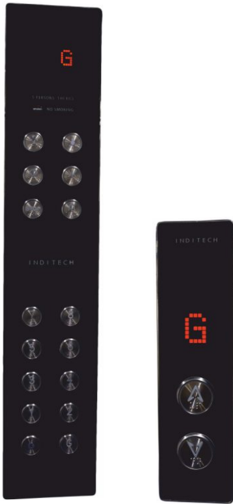
Reco Color Options: • Black • White