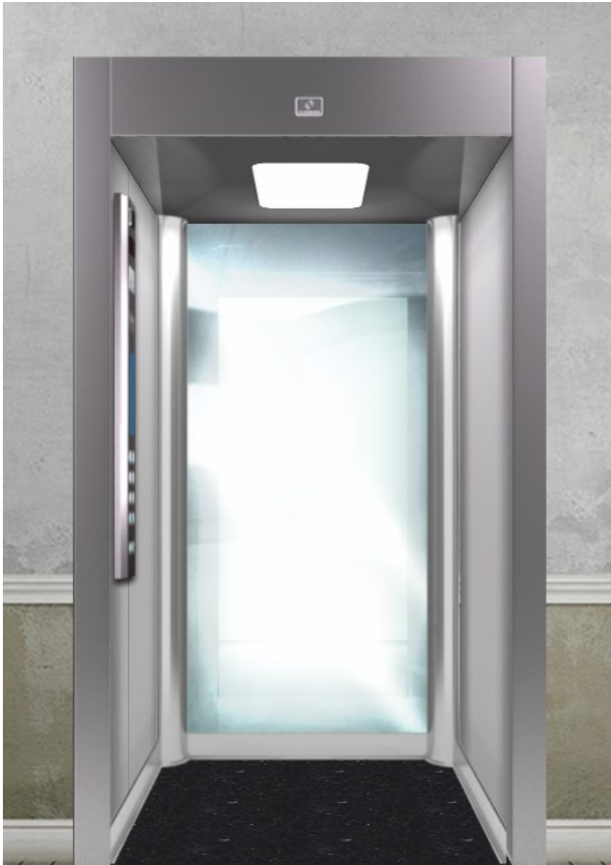
Cabin Panels – Glass with SS Borders Flooring – Wooden Vinyl Tiles False Ceiling – Model 103